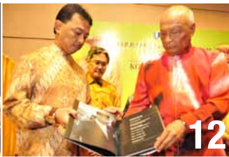
Sultan of Pahang conferred Honorary Doctorate in Civil Engineering