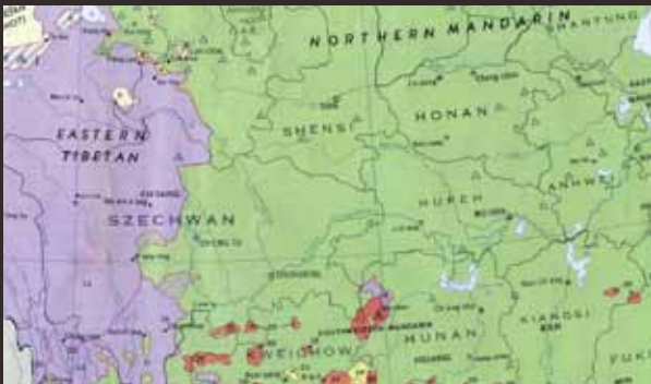
Map of China

University Malaysia Pahang (UMP) opened its doors to the first batch of 37 international undergraduates from China, who enrolled for the six-month English Incentive Preparatory Programme at the university, on January 12 last year.