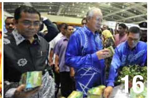
UMP launches book in appreciation of Sultan of Pahang: The Ruler, The Builder, The Engineer