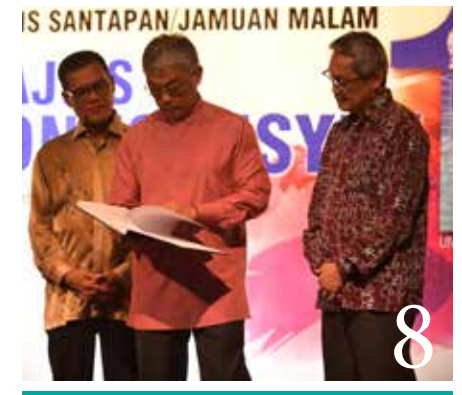
Mutiara Mahkota Launched